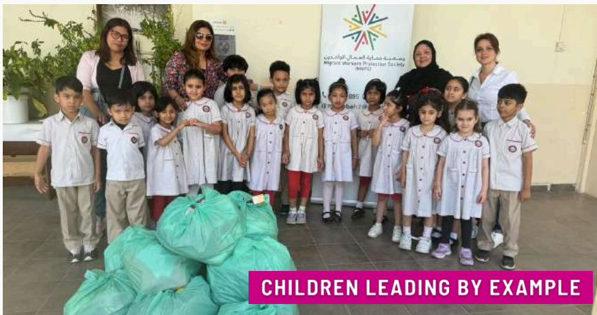
CHILDREN LEADING BY EXAMPLE

In a world where every helping hand counts, the past month has seen a remarkable display of community spirit and generosity. Our newsletter page is dedicated to celebrating the thoughtful contributions that have made a difference in the lives of many.