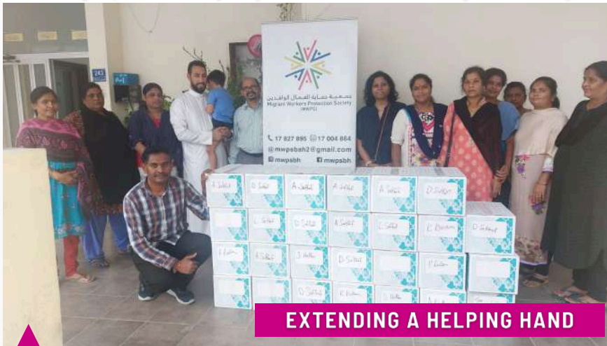
EXTENDING A HELPING HAND

The Manama Rotary Club stepped forward to assist those unemployed or experiencing salary delays. Their donation is a testament to their enduring commitment to community service and upliftment.