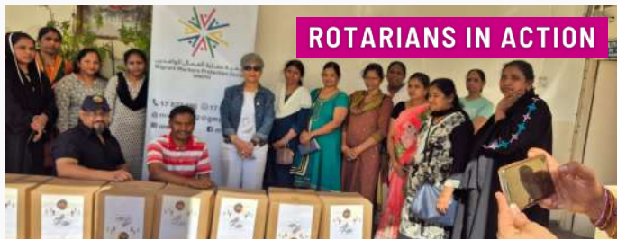
ROTARIANS IN ACTION